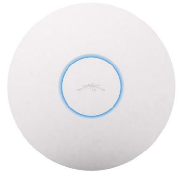
Ubiquiti Wi-Fi Access Point