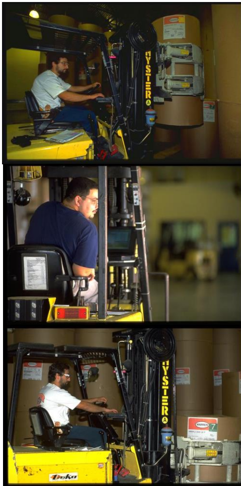
Vehicle Mount laptops w/long range scanners