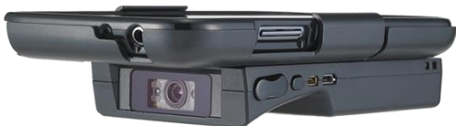
Koamtac KDC450 RFID & 1D/2D