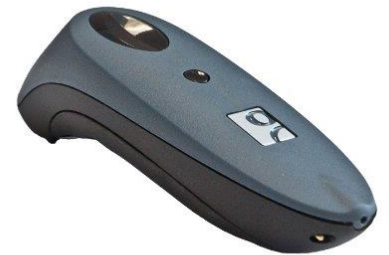
Socket Mobile Bluetooth Scanners